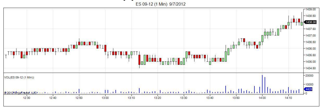
Page 1 Elephant Tracks Software Guide